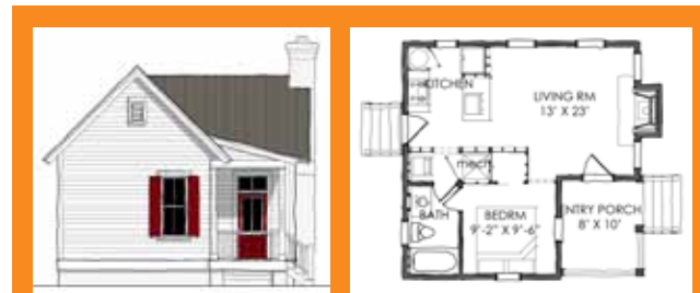
ALTERNATE FLOOR PLAN AND ELEVATION - END LOT OPTION